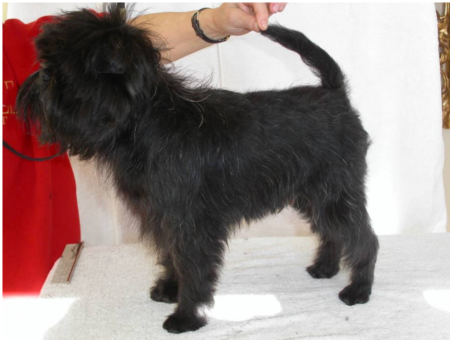
Figures 12 & 13 the finished product!