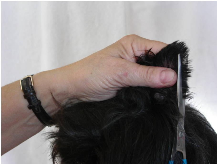
Figure 11 close-up of ear trimming

Clean excessive hair from the inside of the ears with blunt scissors. Often hair grows heavily in the ear canal. It should be removed on a regular, as needed basis. After applying ear powder which helps dry the ears and provide traction for pulling, use forceps, grab a small section of hair, twist, rotate and pull. Continue until completely void of excess hair. Now is the ideal time to check for ear problems. If black debris comes out with the extracted hair, or if the ears smell, seek care from your Vet. It could be a sign of yeast or bacterial infection or perhaps mites. Routine ear care is most important for your dog's well being.