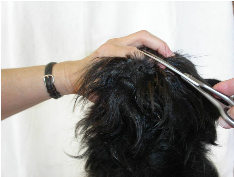
Figures 7 & 8 trim hair over nose in fan shape