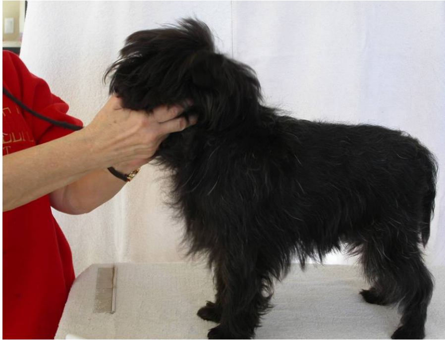
Figure 2 cape as it blends into the back coat

Now rake through the coat from the base of the neck to the base of the tail, down the sides with a medium stripping knife to loosen and grab any additional dead hairs that are ready to come out.