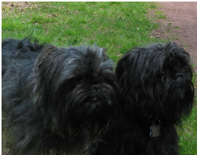
a pair of untrimmed Affens

Okay, now that you have established who is the Alpha dog (that's you), let's proceed!