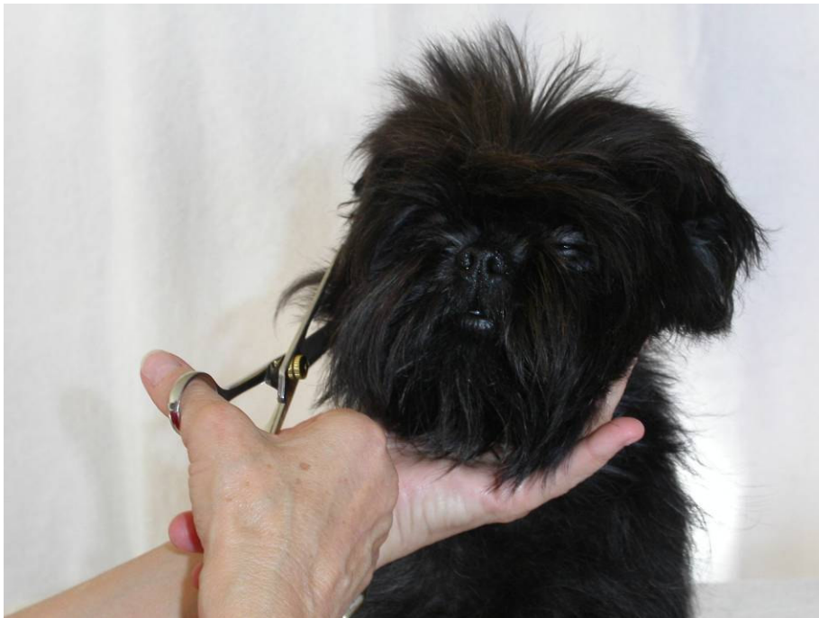
Figure 10 trim the hair at the ears

Trim hair on the outside edges of the ear with blunt scissors, close to the ear leather, being careful not to cut the ear.