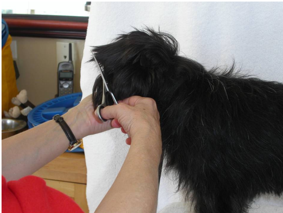
Figure 6 brush hair forward over eyes

Head – Brush the hair on the top of the skull from behind the ears forward over the eyes. Make a cut by drawing an upside down U starting at the corner of each eye.