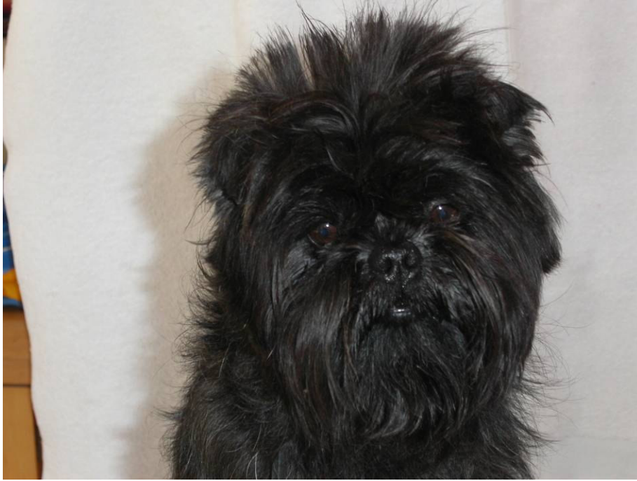
Figure 9 facial hair blended to emphasize the “monkey” appearance

Affen translates from German to English as to “ape” or “mock”. Pinscher translates to Terrier. This “monkey-like terrier” is easily identified by several facial features, namely, eyebrows, whiskers and beard. Hair from the top of the skull should blend into the cheeks, forming the eyebrows, the cheeks into the whiskers and the whiskers into the beard.