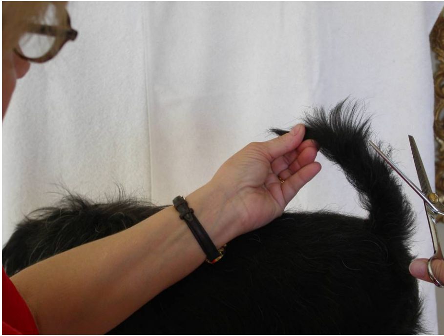
Figure 3 trim tail in a slight curve

Comb the hair on the inside of the legs inward, and shape all four legs straight to look like little columns. Clean the hair around the anus with blunt nose scissors for cleanliness.