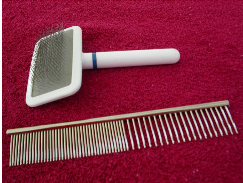
Figure 1 slicker brush and greyhound comb

Using a secure grooming table, with an arm and a noose, place your dog on the table with its head in the noose. Using a small, soft bristle, “slicker”, brush the entire dog in a layered manner, starting at the chest and working up under the chin, under the belly and down the inside of each leg. Brush in a downward motion, work up the sides to the spine, down each leg and out to the tip of the tail. Brush the cheeks, whiskers and beard in layers forward towards the mouth. Brush the hair on the top of the head forward towards the nose.